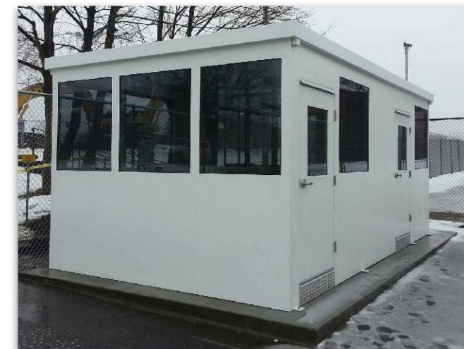
Model BR2012 Durasteel UL 752 with Level 4 bullet resistant construction, tinted glazing and swing doors

The images below and on the following pages you will find application photos that illustrate a few of the many different sizes and styles of ballistic prefabricated buildings we have manufactured. We also encourage you to visit our website to see even more!