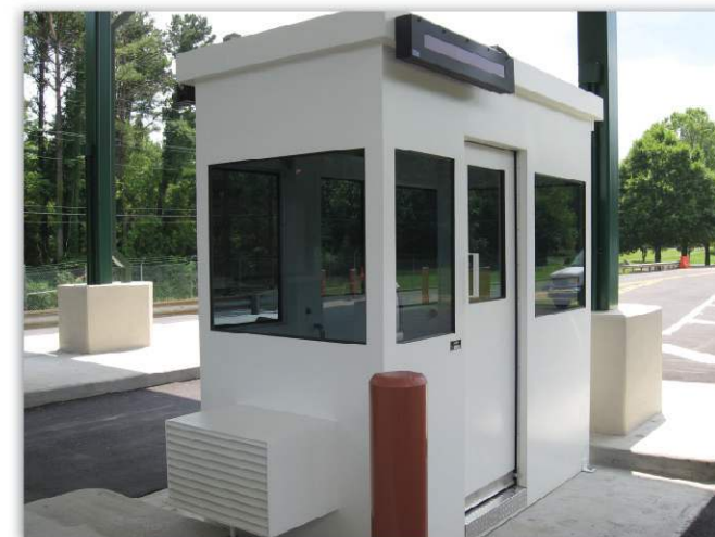
Model BR84 Durasteel with UL 752 Level 3 bullet resistant construction, sliding doors, thru wall HVAC and tinted glazing