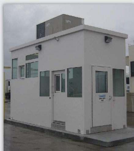
Model BR187 bi-level Durasteel with UL 752 Level 3 bullet resistant construction, swing door, sliding doors, sliding window, exterior lighting and commercial roof mounted HVAC unit