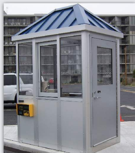
Model BR7648 Duraluminum with UL 752 Level 1 bullet resistant construction, swing door, sliding window and standing seam hip roof