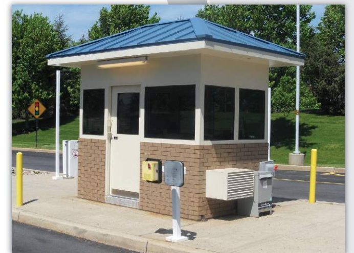
Model BR106 Durasteel with UL 752 Level 3 bullet resistant construction, sliding door, tinted glazing, factory adhered brick finish, thru wall HVAC, exterior lighting and standing seam hip roof with extended overhang