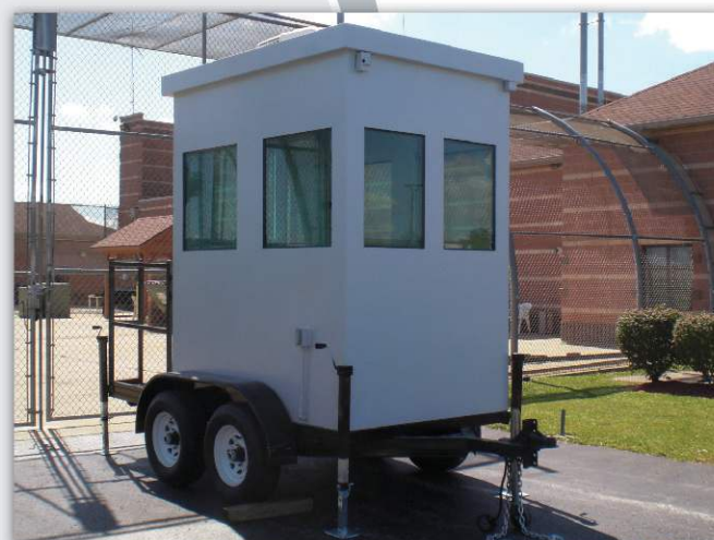
Model TRL-BR75 Durasteel with UL 752 Level 8 bullet resistant construction, trailer mounted and roof mounted AC unit