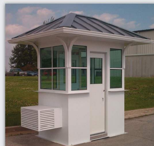
Model BR64 Durasteel with UL 752 Level 3 bullet resistant construction, sliding doors, thru wall HVAC, painted steel window mullions, ready-for-brick cap, standing seam hip roof with extended overhang and decorative rolled steel bars