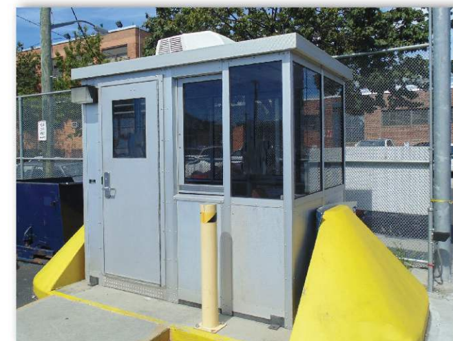
Model BR9676 Duraluminum with UL 752 Level 3 bullet resistant construction, swing door, tinted glazing, sliding window, exterior lighting and roof mounted AC