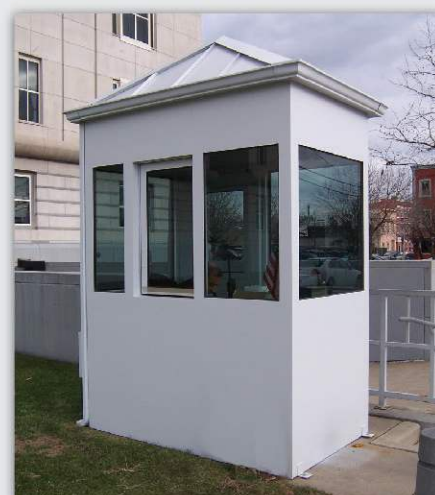
Model BR64 Durasteel UL 752 Level 3 bullet resistant construction, sliding door, sliding window, tinted glazing, thru wall HVAC and standing seam hip