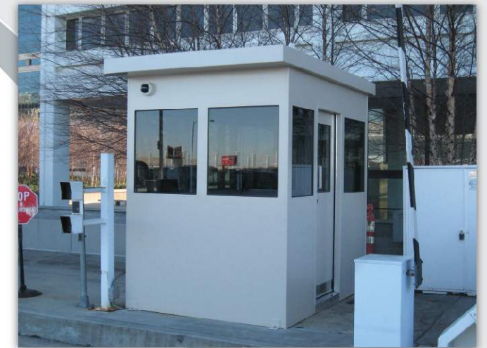
Model BR86 Durasteel with NIJ III bullet resistant construction sliding door and tinted glazing