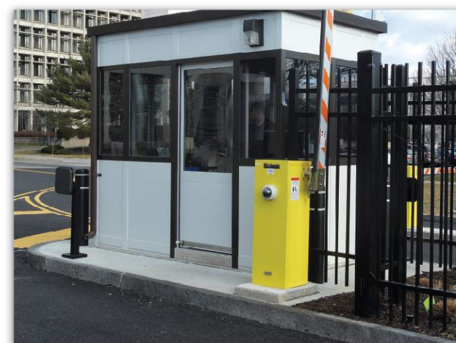
Model BR12076 Duraluminum with UL 752 Level 3 bullet resistant construction, sliding doors, tinted glazing, exterior lighting and custom painted exterior finish