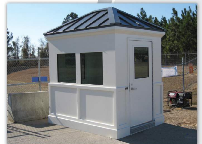
Model BR86 Durasteel with UL 752 Level 7 bullet resistant construction, swing door, tinted glazing, "colonial style" exterior wall finish and standing seam hip roof