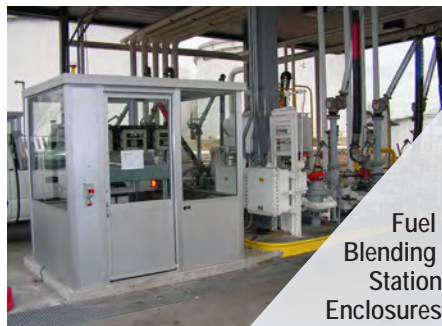
Fuel Blending Station Enclosures