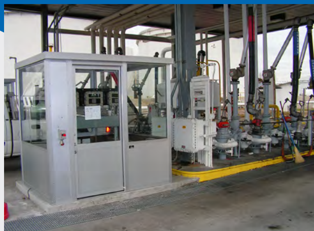
Fuel Blending Station Enclosures