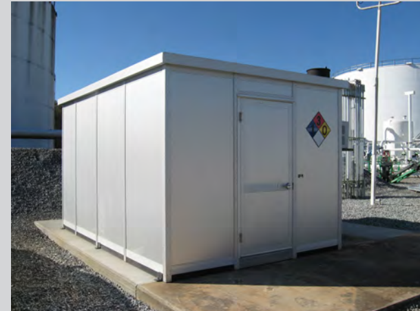
Materials Testing Enclosures