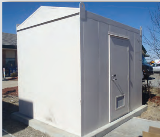
Fuel Blending Stations