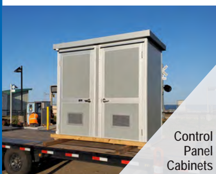
Control Panel Cabinets