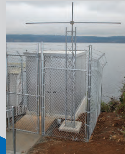
Communications Equipment Enclosures