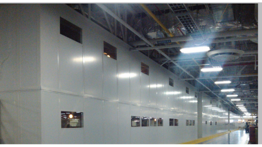
Our modular buildings can be assembled into large, multi-story office complexes like this one to transform unused factory floor space into highly productive work environments.