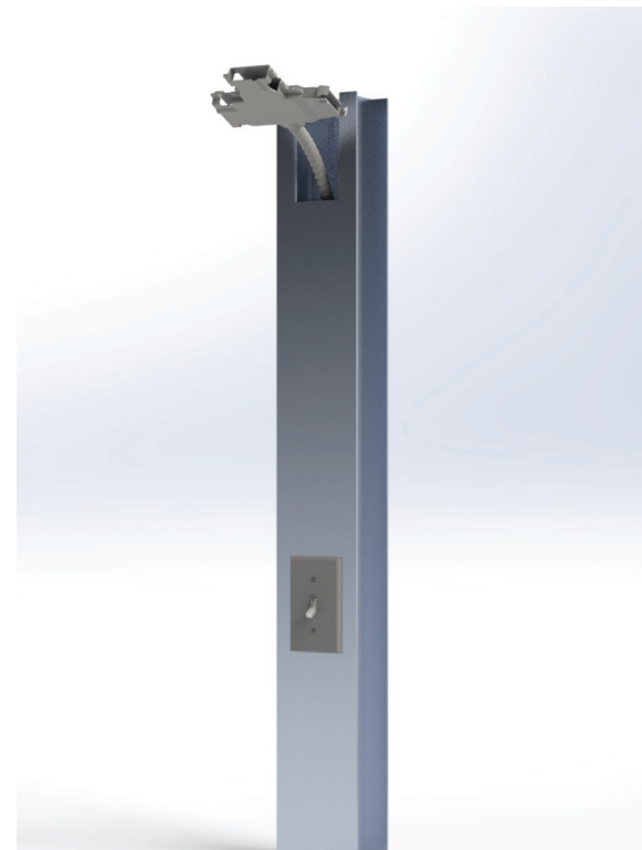
Modular Light Switch – Includes the toggle switch, electric box with mounting strap, and cover plate all pre-wired to a modular extender cable with snap together connector

All components factory tested in accordance and UL listed under Standard 183. Each component includes a label that correspond with a detailed installation manual and component illustrations for easy identification.